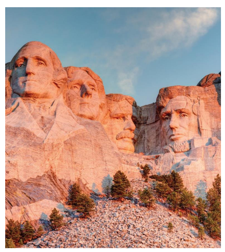
12 Days ● 16 Meals : 10 Breakfasts, 6 Dinners

HIGHLIGHTS... Scottsdale, Grand Canyon, Lake Powell, Bryce Canyon, Zion, Salt Lake City, Jackson Hole, Grand Teton & Yellowstone National Parks, Old Faithful, Sheridan, Bighorn Mountains, Crazy Horse Memorial, Mount Rushmore